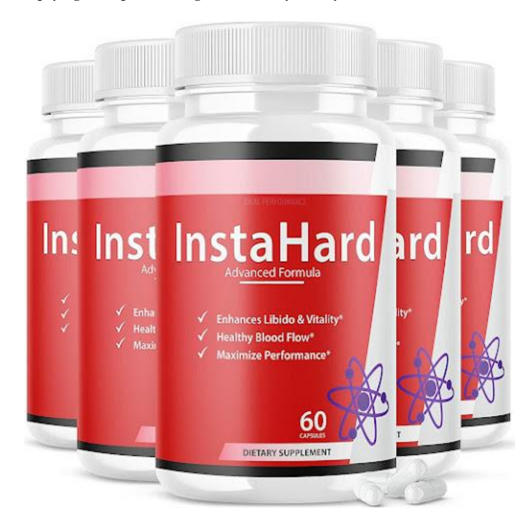
You May Visit Official Website InstaHard On 50% Discount Now!!

InstaHard is a dietary supplement designed to boost testosterone levels in men. According to the official website, it improves sexual stamina, strength, and vigor, plus its continuous use also ensures a visible change in the penis size. It is much better and safer than trying bizarre devices or paying for expensive surgeries that may or may not work.