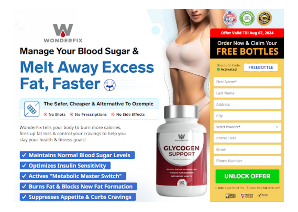
Special Price for Sale: Wonderfix Glycogen Support Canada!! Available! Order Now!!